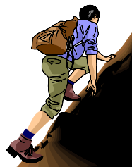
ADVANCED Helping you Climb to Higher Ground