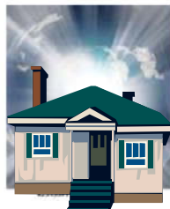
FAMILY Helping you Make your home Holy Ground