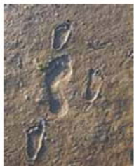
BASIC Helping you Set you feet on Solid Ground

Every Christian has a ministry (Ephesians 4:10-12), and we want to help you develop your leadership potential, both in the church and in your home. Here is a list of courses that are being offered in three different tracks. Everyone is welcome to take any of the courses whenever they are offered. Please plan to take advantage of these courses. Call the church office for more info. at 909 989-3119.